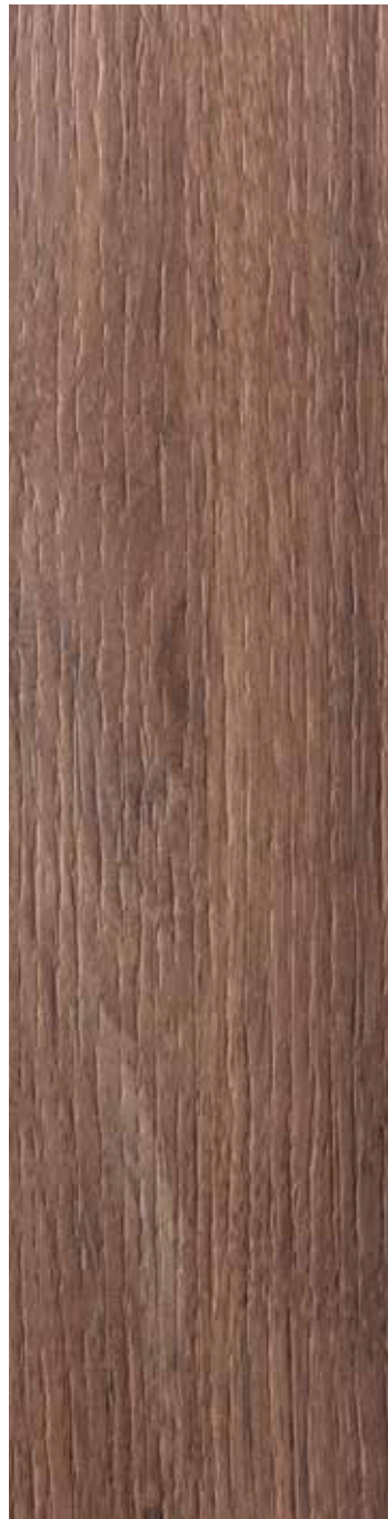
4617 Noce Carya Light