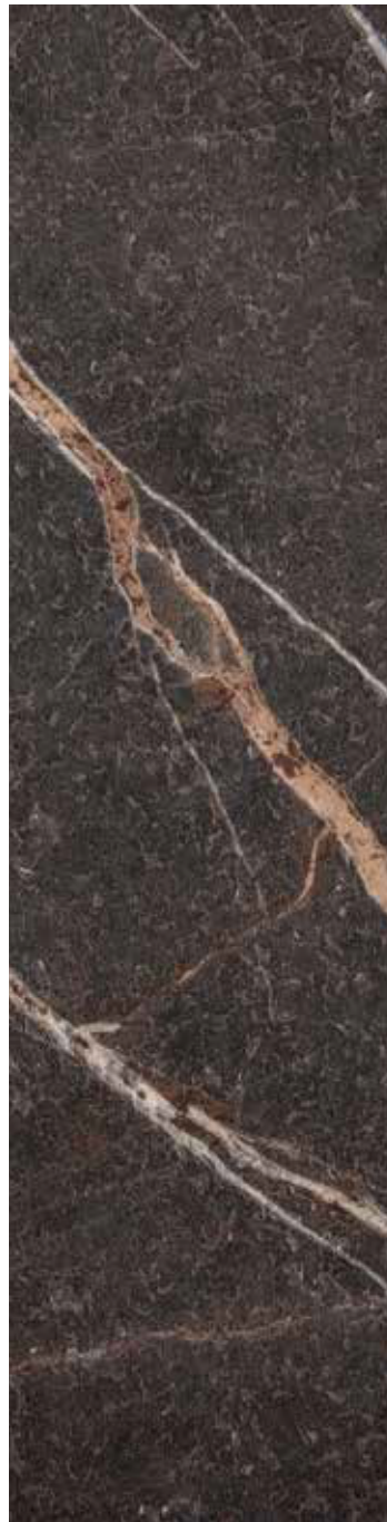
3446 Pulpis Dark